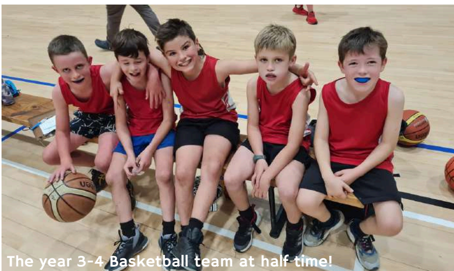
The year 3-4 Basketball team at half-time!