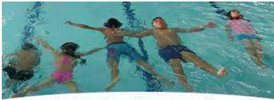
Kids have fun and learn watersafety

EVERYONE BRING YOUR TOGS ON THURSDAY!!!!!! (TOMORROW)