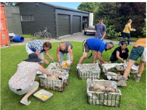
5.30pm Phew! It looks cooked!