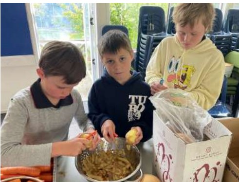
8.30am - If you come into the hall, you have to peel some veggies!