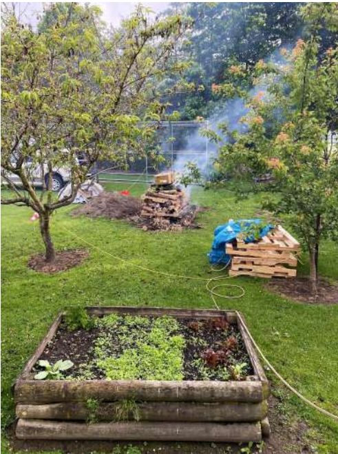
7.30am- The first wafts of smoke

I did hear a few people say that it was the best hāngi kai that they had tasted. It is amazing what 18 roasts, many many kilos of veggies and 25lb of butter turn into when left in the hot earth for 6 hours.